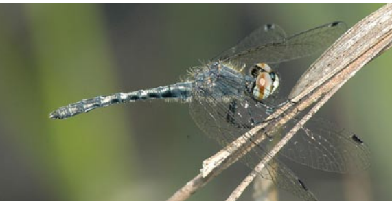
Adult male (top), Adult female (middle), Immature male (bottom)